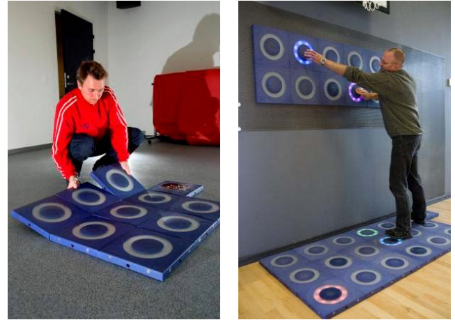
Figure 2. Left: easy set-up by physiotherapist. Right: Wall and floor game.

order based on the speed on the stepping. The game can be performed between two patients where radio communication between two clusters of tiles is used to indicate who of the two patients is leading in the competitive game.