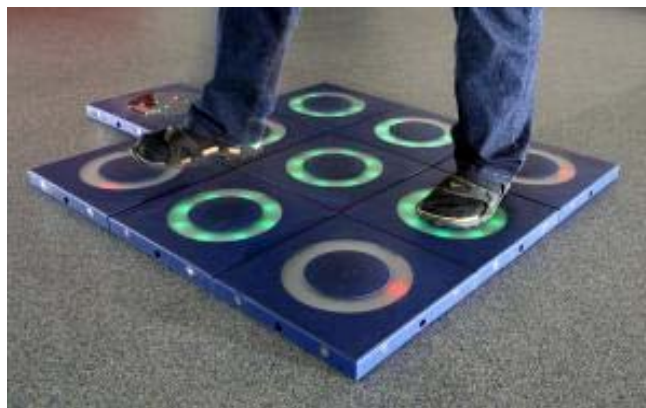
Fig. 1. Modular robotic tiles used for playful physiotherapy.

H. H. Lund is with the Center for Playware, Technical University of Denmark, Building 325, 2800 Kgs. Lyngby, Denmark (phone:+45 45253929; email: hhl@playware.dtu.dk ).