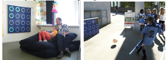
Fig. 3. A child and her father in the multi-sensory room (left), and children playing soccer with the modular robotic tiles (right).

Among many different games, we implemented the colour race game, where the child has to chase a given colour, which jumps around on the surface of tiles. The modularity of the tiles provides flexibility for creating tangible interaction. If the child (or teacher) wants playful interaction with hands, she places the tiles on a wall so that the child needs to play with the hands, or if she wants interaction with the feet, she may place the tiles on the floor. Or she can choose a combination of some tiles on the ground and some tiles on the wall for playful interaction with both hands and feet. For the soccer game, a light is travelling around on the tiles, and the child has to hit the travelling light with the ball, which will light up all the tiles to indicate that a goal was scored – the game becomes an interactive version of playing soccer up against a wall (Fig.3, right).