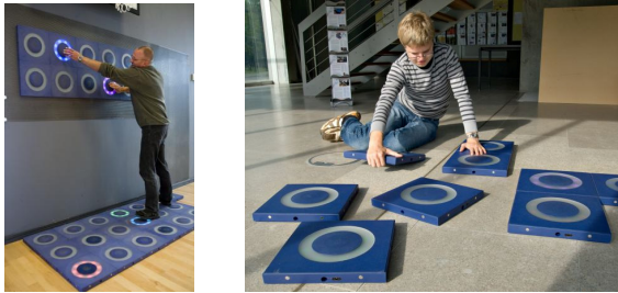
Fig. 1. The modular robotic tiles for sensorimotor play (left) and for construction play (right).

We developed modular robotic tiles according to the key features of the design approach described above, in order to create a modular playware with the possibility for users to modify the physical shape and make easy setup for a variety of play activities. Further, we designed the modular system with the possibility of exclusion of external host computer, with self-contained energy source, with wireless communication (local and global), and with different games.