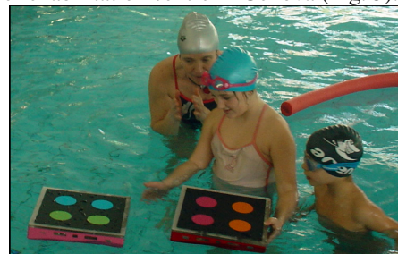
Fig. 5. Trials with active surfaces

Active Surfaces have been experimented in different Italian institutions: the 'Le Scotte' Hospital in Siena, the Disabled Children Parents' Association in Siena and the D. Chiossone rehabilitation centre in Genova (Fig. 5).