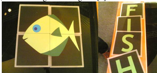
Fig. 4. Examples of games with active surfaces

The Active Surfaces prototypes support construction activities on different levels: i) on the logical level the therapist can define what the rules of the game are and what the purpose is; ii) on the functional level users can mark out the relations and the sequences and; iii) on the physical level users can define which patterns and connections can take place, to reach the goal of the game [3].